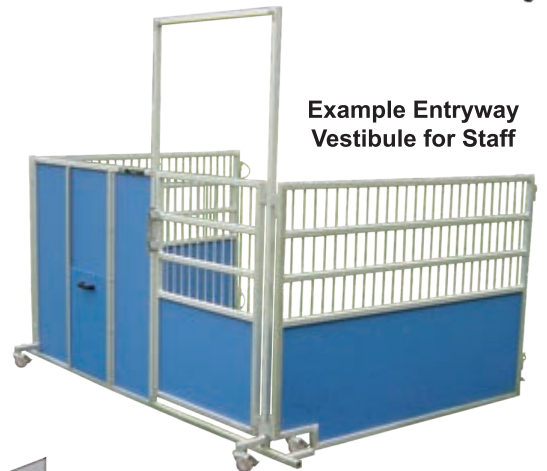
Example Entryway Vestibule for Staff