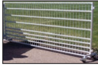
Introduce a dog to the pack with a full grille panel