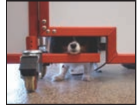
Tiny Gaps for Tiny Dogs