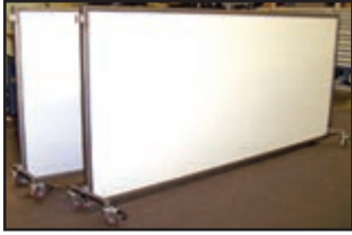
Solid panels prevent dogs from seeing each other