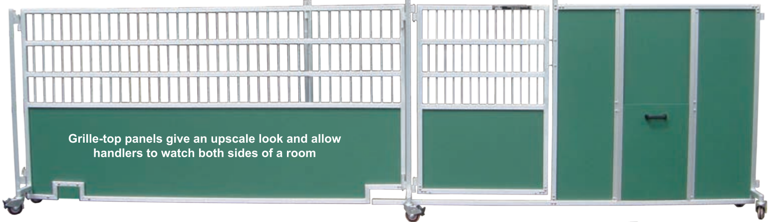
Grille-top panels give an upscale look and allow handlers to watch both sides of a room