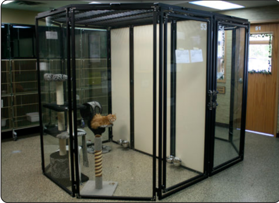
Add furniture and accessories to create a luxury space for feline guests