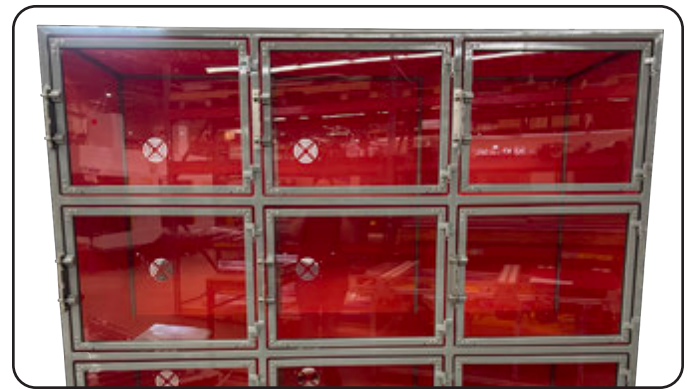
9-Condo Bank with Glass Doors