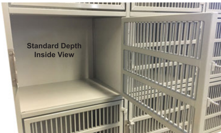
Standard Depth Inside View