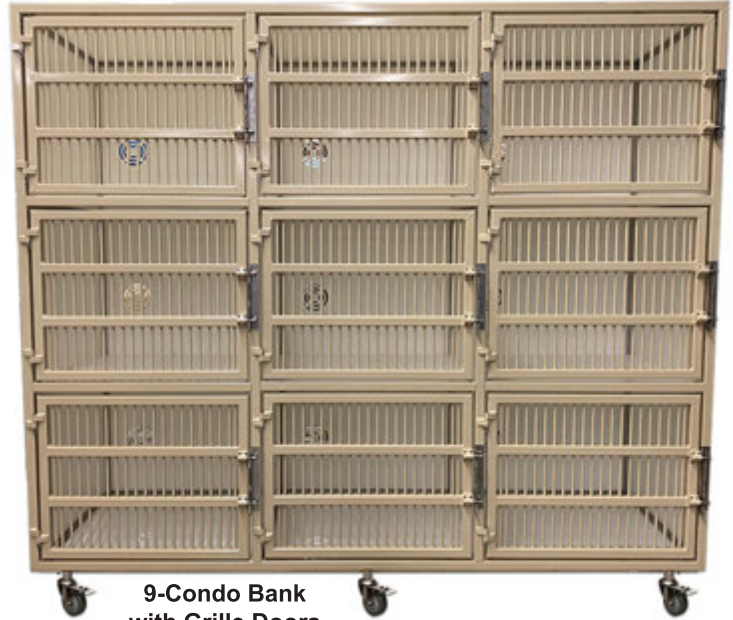
9-Condo Bank with Grille Doors